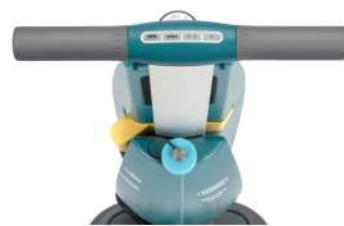
i-mop Lite controls