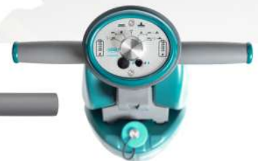
i-mop XL Plus controls